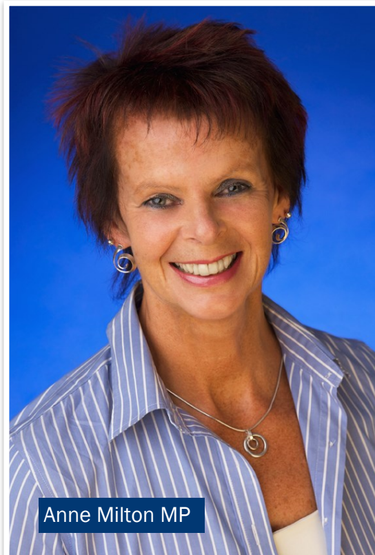
Anne Milton MP

We have achieved a great deal as a Coalition