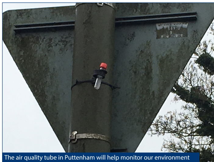
The air quality tube in Puttenham will help monitor our environment