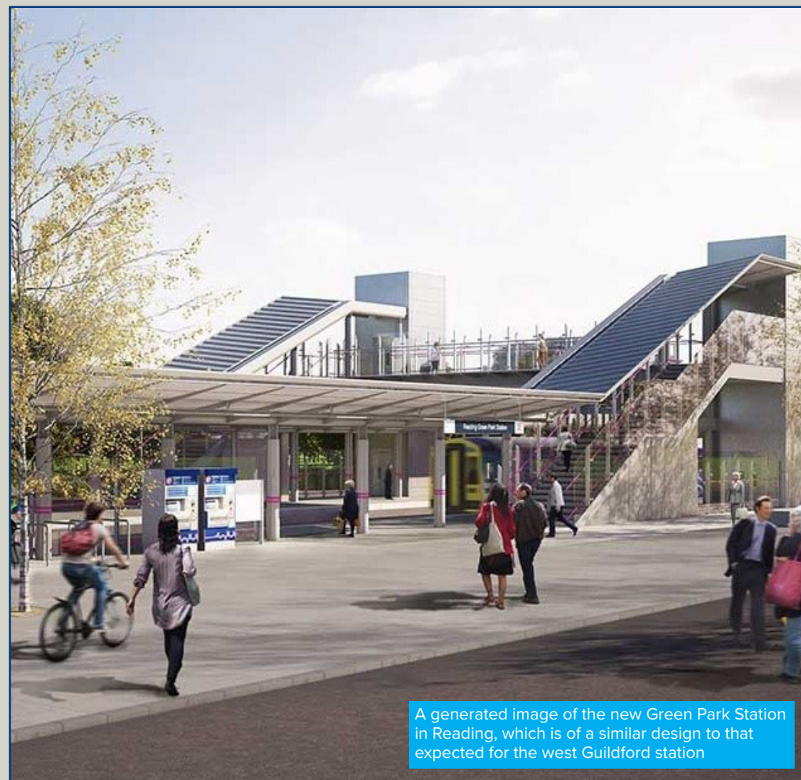
A generated image of the new Green Park Station in Reading, which is of a similar design to that expected for the west Guildford station

Bringing Guildford closer through transport projects is important for the future. Conservatives are delivering a better-connected Borough.